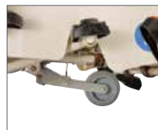
Steering Plus™ System