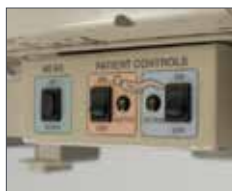
Caregiver Control Panel