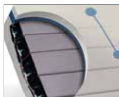
AccuMax® VPC Surface