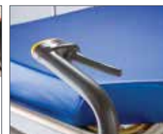
Active Hand Brake