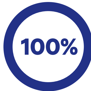
SECOND READ SUCCESS RATE

In addition to determining the percentage of successful blood pressure readings, researchers also analyzed the accuracy of those readings. During this study, the device's blood pressure algorithm demonstrated consistency between readings, even when movement was present, producing 85-87.5% of readings in a range of +/- 10 mmHg as compared to the manual device for the systolic and diastolic. 7,8,9