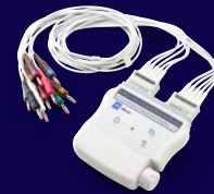
Welch Allyn Wireless Acquisition Module (WAM)