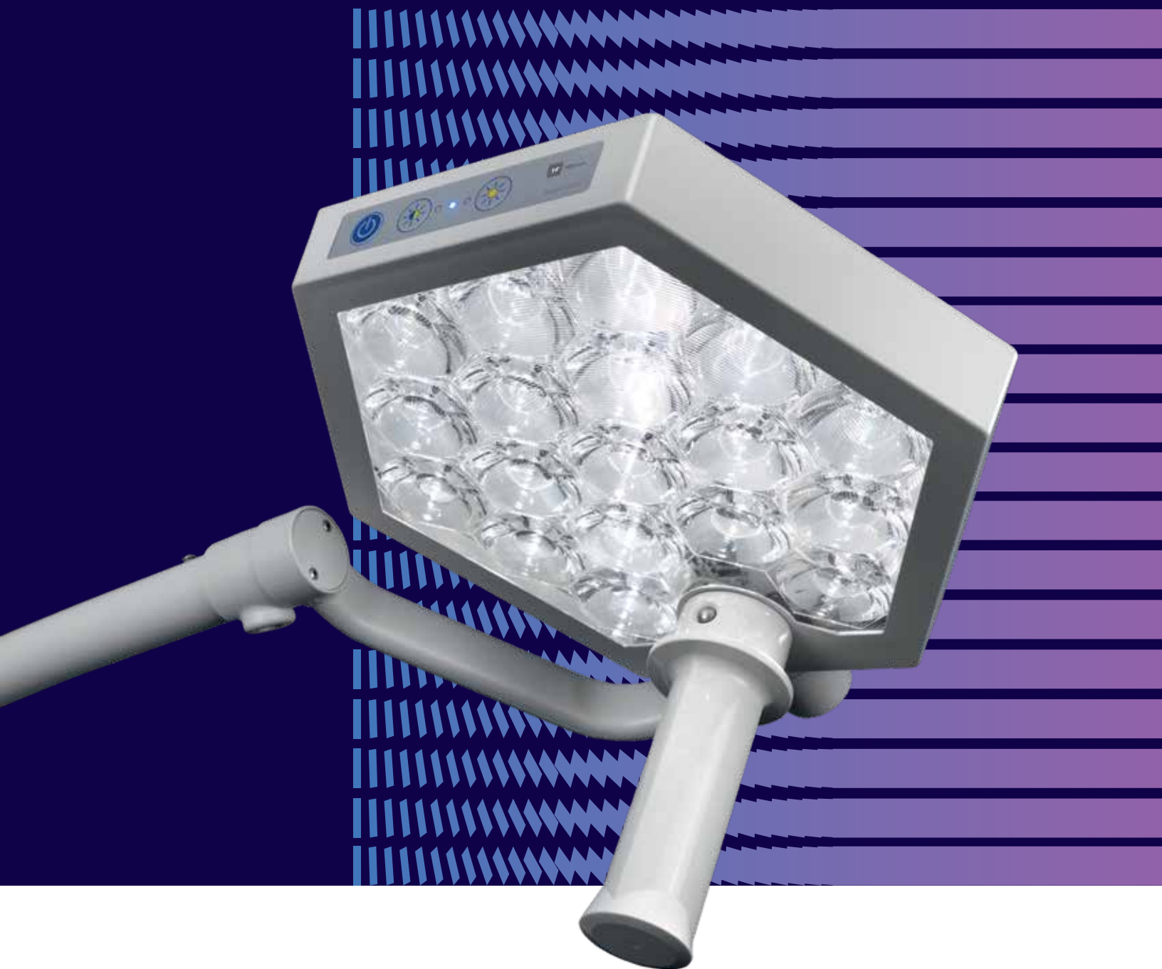
TL 1000 Exam Light Wide range of applications