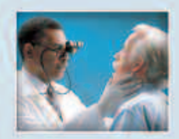
The Welch Allyn LumiView can be easily flipped up out of your line of sight, giving you the option of adding some tightly focused illumination to your examinations.