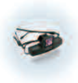
Spectacles Brass-framed spectacles easily accept prescription lenses.