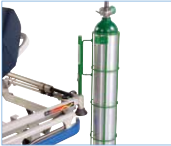
Vertical Oxygen Tank Holder product no. P27601 (Mounts in IV sockets)