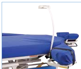
Gas Delivery/ Drape Support Device product no. P263