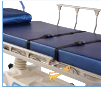
Transport Strap product no. P349