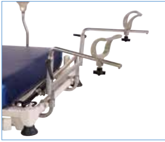
Ankle Stirrups product no. P347AT (Folds away when not in use)