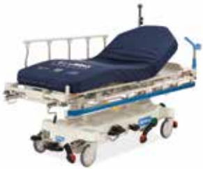
HILL-ROM® PROCEDURAL STRETCHER