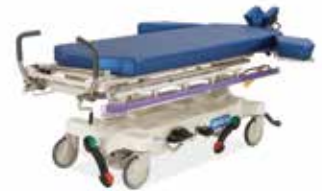
HILL-ROM® SURGICAL STRETCHER

700 lbs — Weight capacity of all Hill-Rom® Stretchers