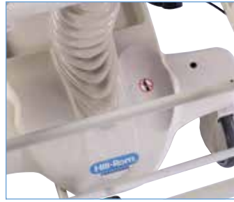
Paper Roll Dispenser product no. P364AT01 (Standard Width 26") product no. P364AT02 (Wide Width 30")