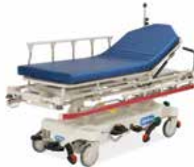
HILL-ROM® TRAUMA STRETCHER