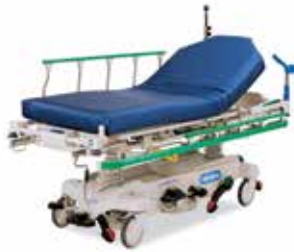
HILL-ROM® PROCEDURAL STRETCHER WITH INTELLIDRIVE® POWERED TRANSPORT