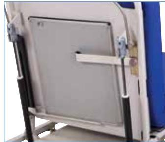
Upright Chest X-Ray Cassette Holder product no. P279AT