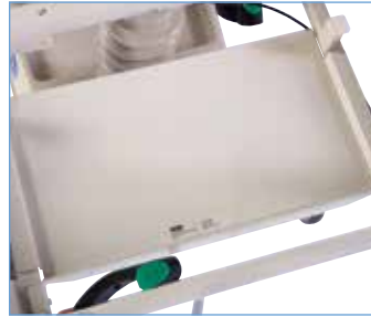
Utility Tray product no. P297B01 (Standard Width 26") product no. P297B02 (Wide Width 30")