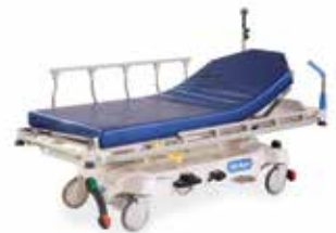
HILL-ROM® TRANSPORT STRETCHER