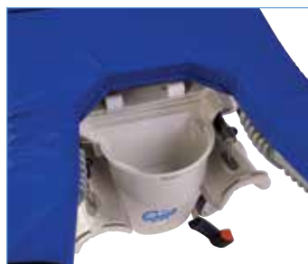
Detachable Catch/ Fluid Basin product no. P265