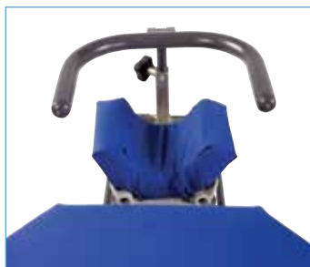
Superior Wrist Rest product no. P262A01