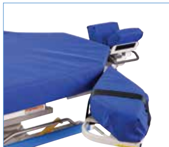
Integrated PACU Extenders product no. P261ECP