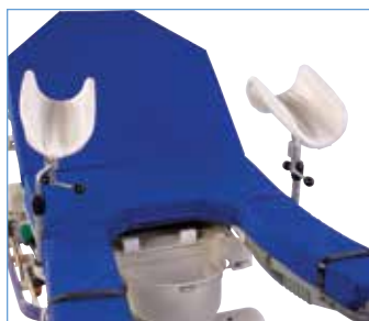
Telescoping Calf Supports product no. P35745AT