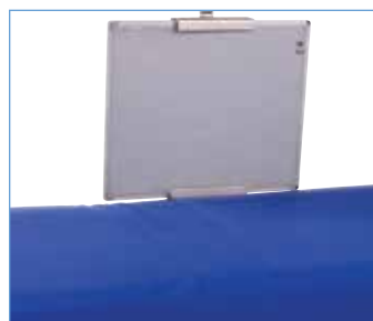
Lateral X-Ray Cassette Holder product no. P264