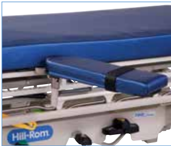
Armboard product no. P344CT