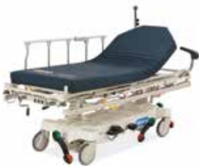
HILL-ROM® ELECTRIC STRETCHER