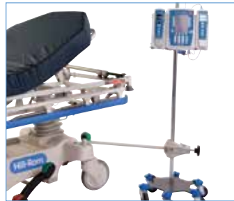
IV Transporter Device product no. P491