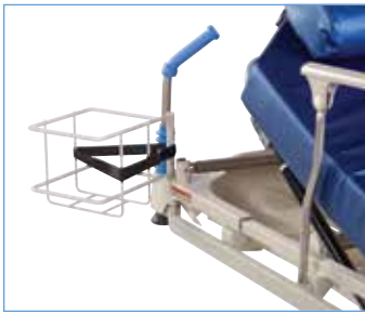
Liquid Oxygen Tank Holder product no. P273