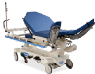
HILL-ROM® OB-GYN STRETCHER