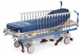
HILL-ROM® PROCEDURAL STRETCHER WITH ENHANCED SAFETY SIDERAILS