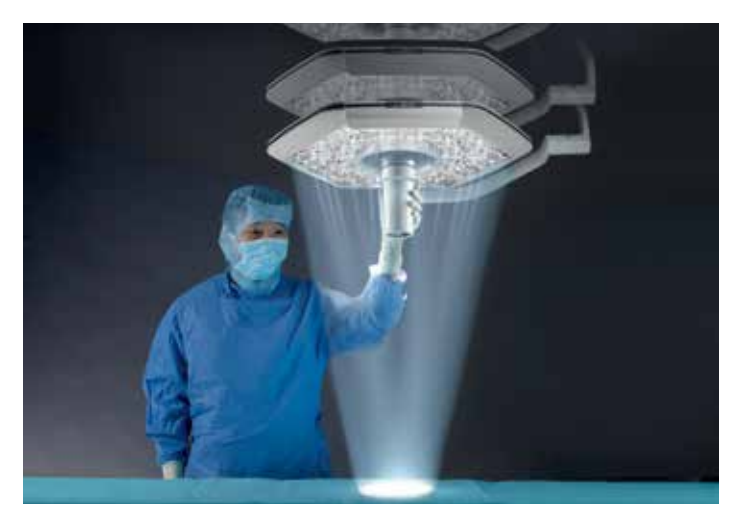
Consistent illumination at typical working distances.

The iLED® 7 Surgical Light's 3D sensor system provides consistent lighting conditions and eliminates unwanted shadows, even when the surgeon is working directly beneath the light head. The system identifies obstacles in the field of illumination and activates or deactivates individual LED modules accordingly. As a result, the surgical field is properly illuminated without the need for manual adjustment allowing the surgeon to focus on the patient and the task at hand.