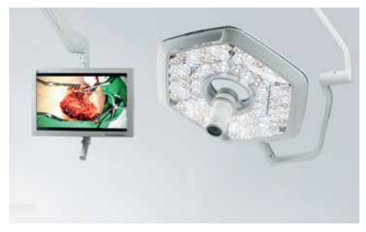
TruVidia® Wireless Camera System provides excellent image quality and encrypted transfer provides maximum data security.

The iLED® 7 Surgical Light can be directly connected to the innovative TruVidia® Wireless Camera System via the handle, providing clear images in full HD. Individual images for documentation purposes are possible using the snapshot function. Benefits of wireless technology: ability to install and/or upgrade this system with minimal additional cost or the need for complex video cabling.