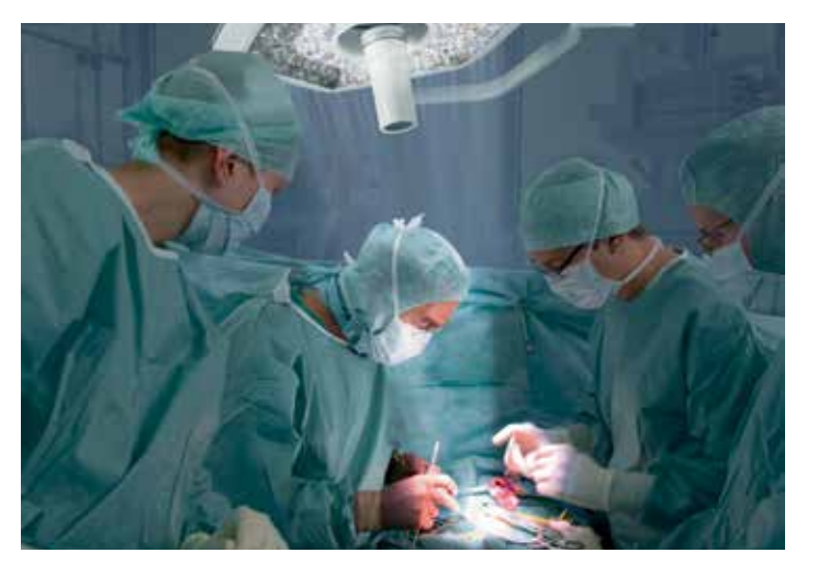
3D sensor technology provides consistent lighting of the surgical site.