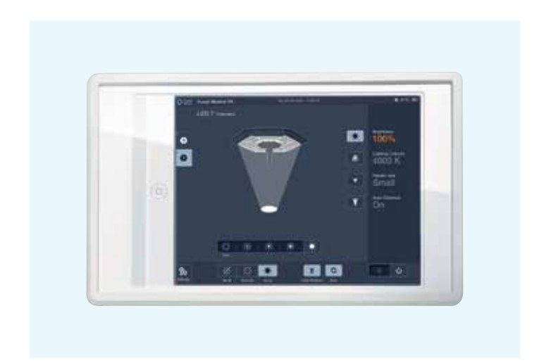
Intuitive and reliable wall control.

Once the surgeon has selected the pattern size (6", 8" or 10"), the light head automatically maintains that size throughout the procedure, at any typical working distance.