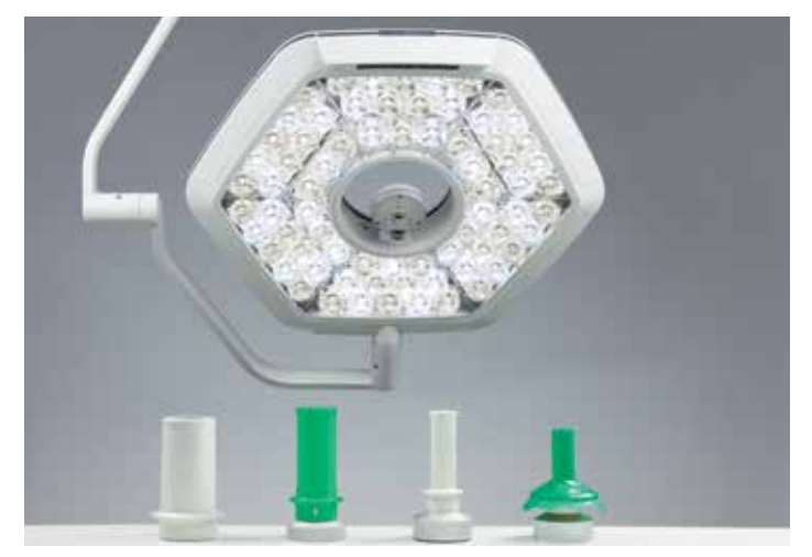
All iLED® 7 Surgical Light's are camera ready — enabling you to upgrade at any time.

When the light head is repositioned, the 3D sensor automatically adjusts to ensure a consistent illumination level. This eliminates any manual readjustments to the lighting conditions — saving time and allowing the surgeon to focus on the surgical site.